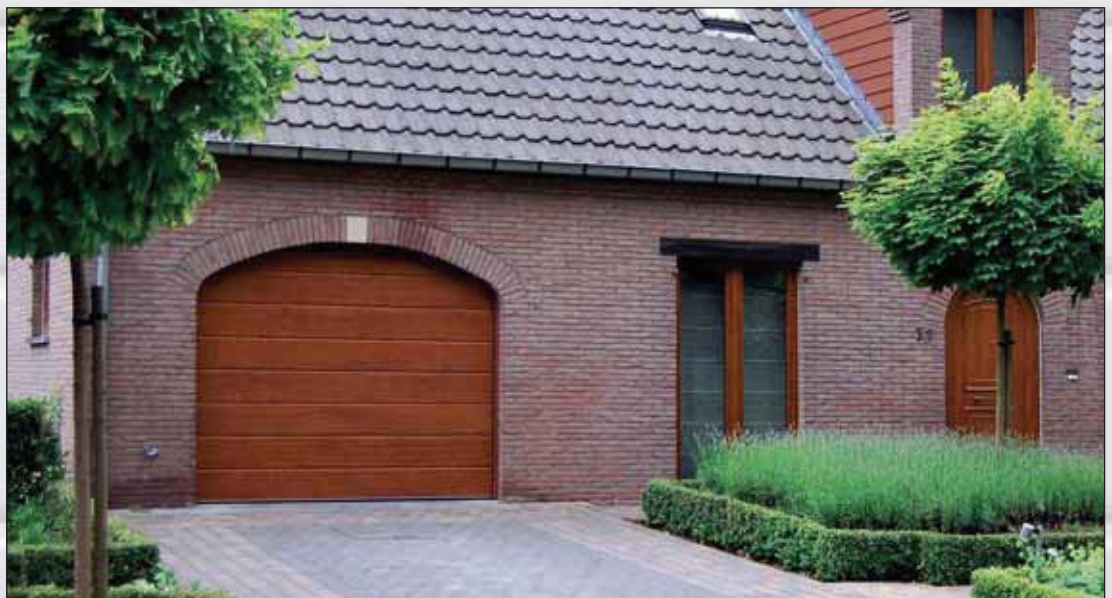
"Centre ribbed" design with a "Dark Oak" wood surface.