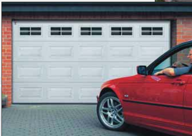
With stylish cross mullion glazing.